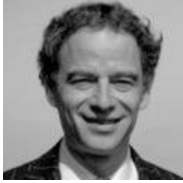
LOUIS BONT UNIVERSITY MEDICAL CENTER UTRECHT, UTRECHT, THE NETHERLANDS