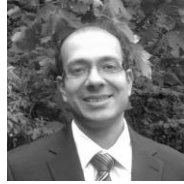
HARISH NAIR CENTER FOR POPULATION HEALTH SCIENCES, THE UNIVERSITY OF EDINBURGH MEDICAL SCHOOL, EDINBURGH, UNITED KINGDOM